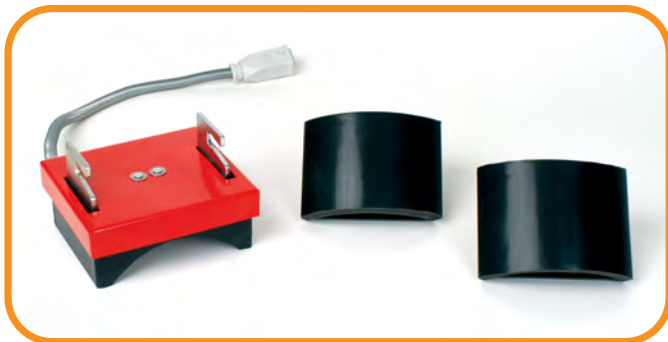
Pict. 1 · cap set

The clearly arranged digital display allows you to conveniently set and control transfer time and operating temperature. High-quality heating technology provides quick warmup. Even and constant operating temperature is guaranteed as well as extended durability of the heating elements.