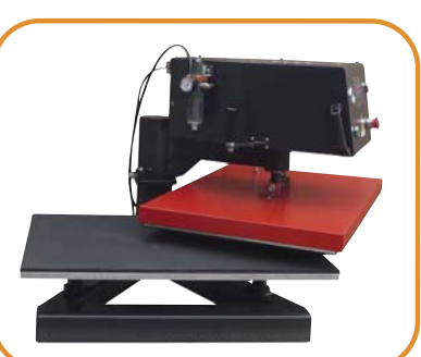
Fig. 1 · easy swivelling