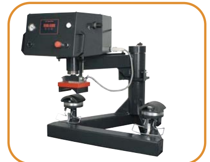
Fig. 4 - Cap set

info@lotustransfers.com +49 (0)30 40 50 45 80