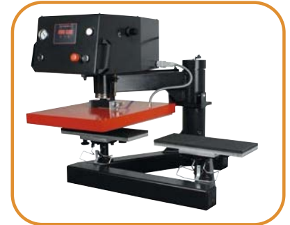
Fig. 1 - Support plates for sleeves or trouser legs - crosswise