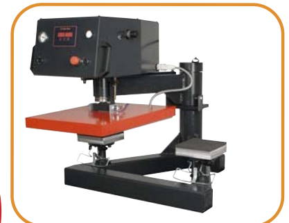
Fig. 2 - Support plates for breast pockets