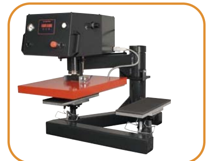
Fig. 3 - Support plates for sleeves or trouser legs - lengthwise