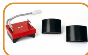
Fig. 6 · Cap set