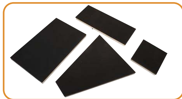
Fig. 5 · Girlie plate, oblong plate, umbrella plate, and smaller square plate